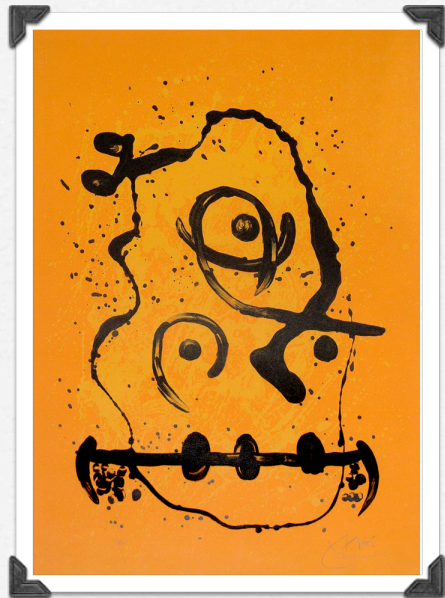
The Polyglot Man - Orange, 1969 Miró, Joan (1893-1983)